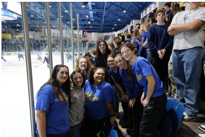
Student Section cheering on our Lakers!