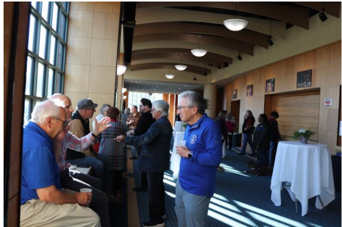
Arts Center 20 th Anniversary Open House