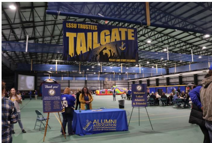
Board of Trustees Pre-Game Tailgate!