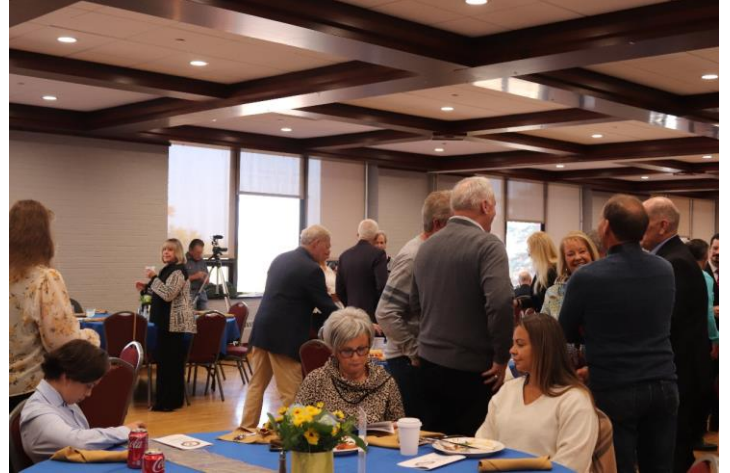
A SOLD OUT crowd (over 200) visit before the Alumni Awards and Hall of Fame Induction Ceremony.