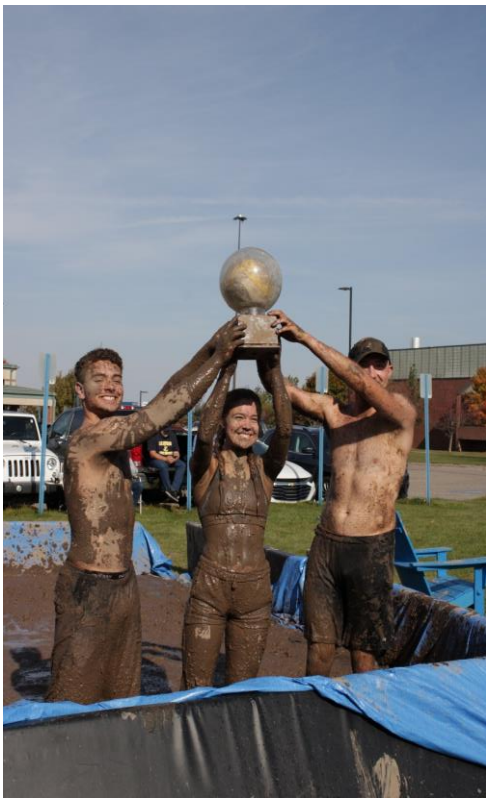
Oozeball tournament winners!