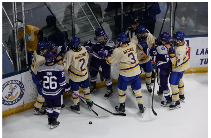
LSSU Lakers vs. Stonehill College