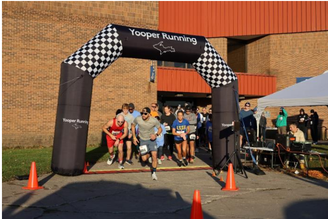
5K Fun Run!