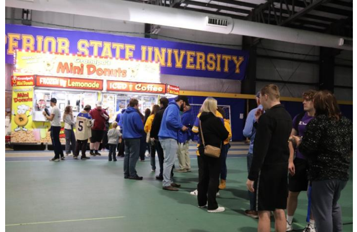
Food Truck at the Tailgate!